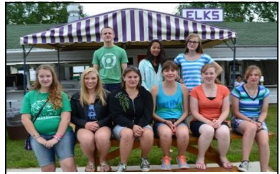
BHS Symphonic Band Orientation session II attendees.