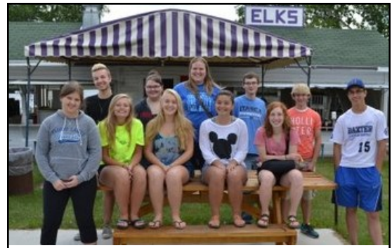
Brainerd High School Symphonic Band Orientation session I have learned the "ropes" on where things are and how to take orders for customers.