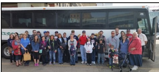
Many veterans and family members prepare for a Twins game at Target Field.